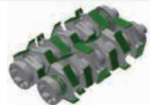
paddle shaft for universal waste