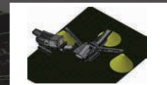
KROKODILE + KOMPATTO 5030

With our Shredder, Screener and Granulator we offer you a perfect bespoke solution to turn milled asphalt or slabs chunks in a new aggregate without destroying the original grain structure and without damaging bitumen coating on the stone surfacing.