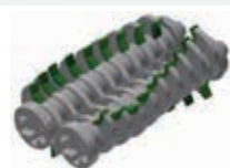
teeth shaft for c&d - asphalt